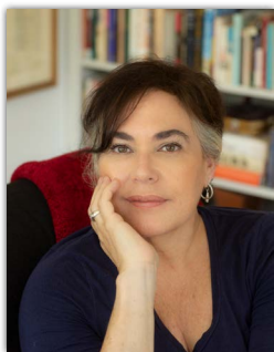
In Love Amy Bloom