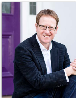
The Escape Artist Jonathan Freedland