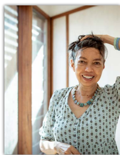
Scary Monsters Michelle de Kretser