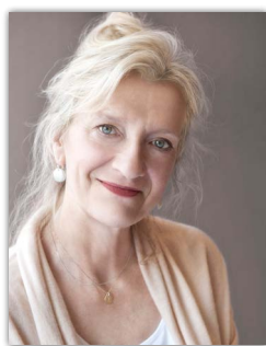
Lucy by the Sea Elizabeth Strout