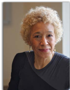
Constructing A Nervous System Margo Jefferson

About the Folio Prize | Established in 2013, initially with the sponsorship of The Folio Society, The Folio Prize is the first major