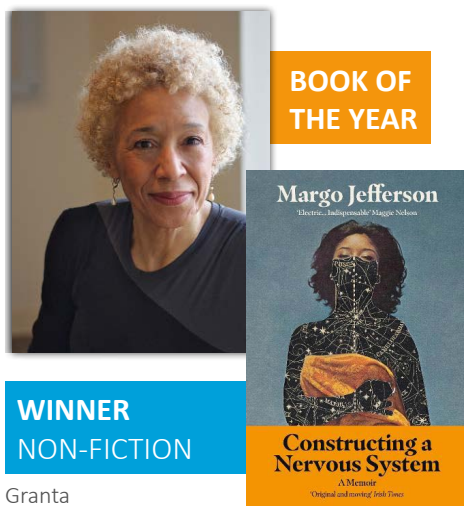
Margo Jefferson Constructing a Nervous System