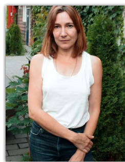
Pure Colour Sheila Heti